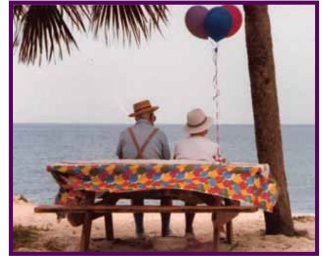
Remembering those who forget