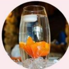
DECOR AND LINEN SET UP & RENTAL