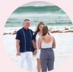
OFFICIATING, PLANNING & COORDINATING