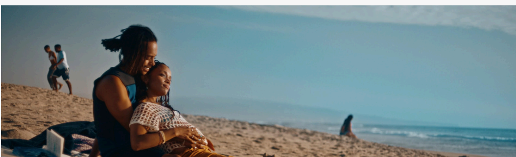
[Still from Water Angel, TIFF Logo & DiDi Poster.]