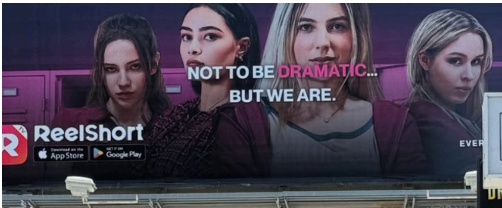
ReelShort Billboard in LA for True Heiress vs. Fake Queen Bee