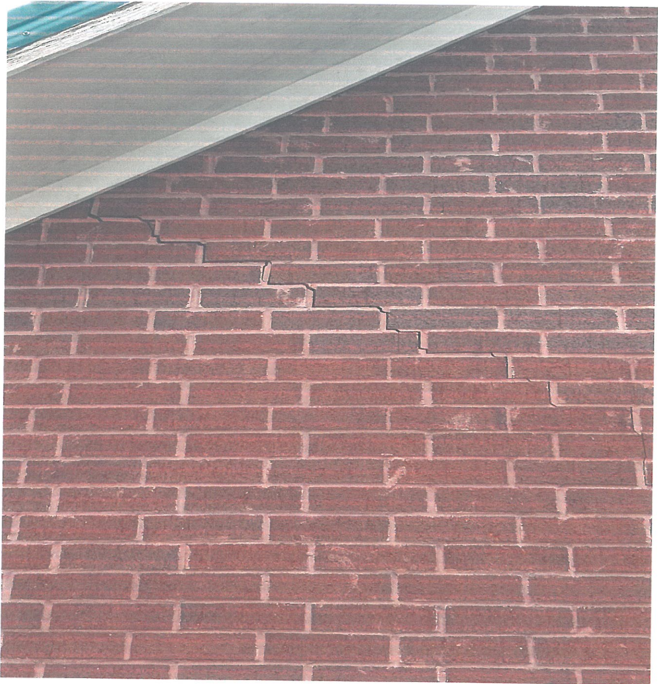
Repoint crack in mortar joints (east side, upper half)

All siding on the building needs to be cleaned. All flashing and any other point where water may enter the building needs to be sealed. Contractor will keep the work area clean and free of debris. All materials shall be removed by Contractor at the end of the project. All work shall be performed in a craftsman-like manner. Any work outside the scope must be approved by change-order before the work commences. Any additional work without a change order will not be paid.