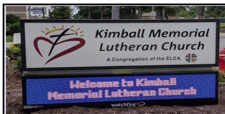
New Sign Installed

TODAY IS THE DAY OF PENTECOST - the Birthday of the Church. Beginning today, we enter the long season of Pentecost - for the next 25 weeks the Church will explore the mission and ministry of Jesus. During this Summer Season, our worship services will have some changes. For much of the Summer, our first lesson will be a reading from the Old Testament. At the 11:00 Service, we'll return to three hymns for most of June, July, and August...as our chancel choir takes a summer break from rehearsals. You will also notice that we won't be using the Kyrie or Hymn of Praise this Summer, but will be using an expanded Communion liturgy at 11. These changes are just to give us a variety in our worship during these three months. We hope you'll be here to join us for worship, whichever service you attend. We appreciate your presence with us each and every Sunday!