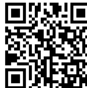
St. John's Calendar