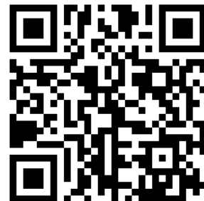
St. John's Calendar