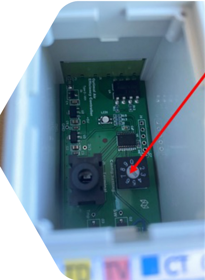
Current Config Setting switch see table and instructions

All work must be carried out by qualified electrical staff in accordance with the local electrical Authority requirements and all Occupation Health and Safety requirements of the client.