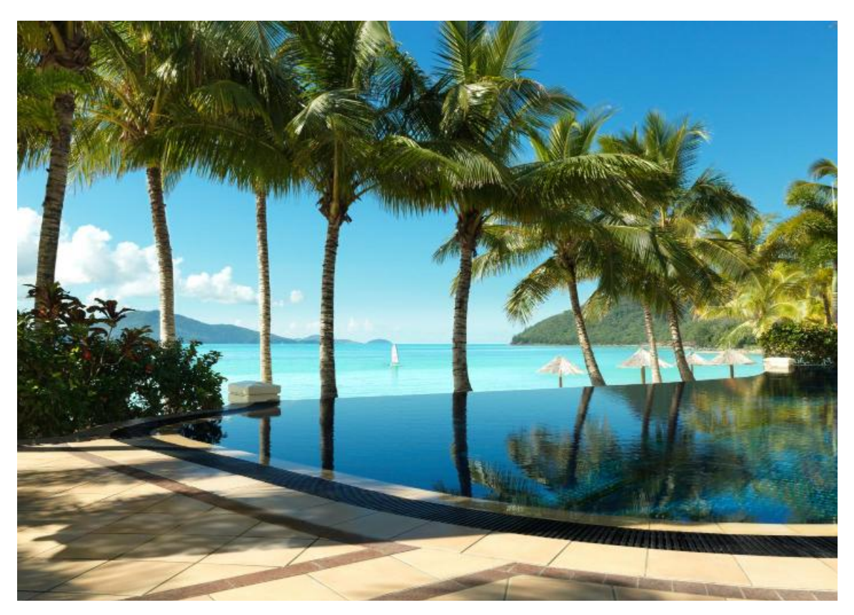
next. Room rates from $1300 per night