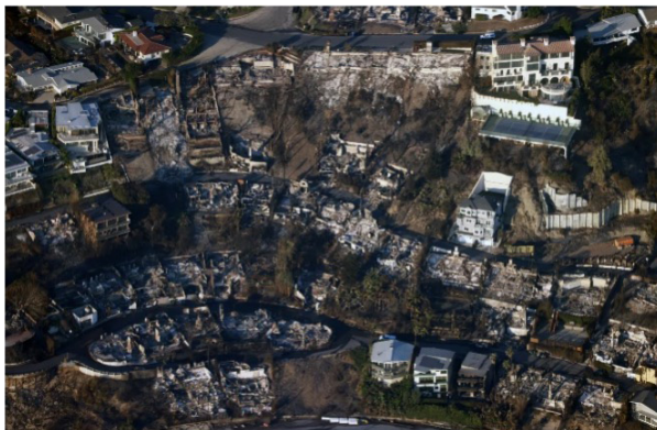
Friday, Jan. 10: This aerial photo shows homes and businesses reduced to smoldering rubble by the Palisades Fire.