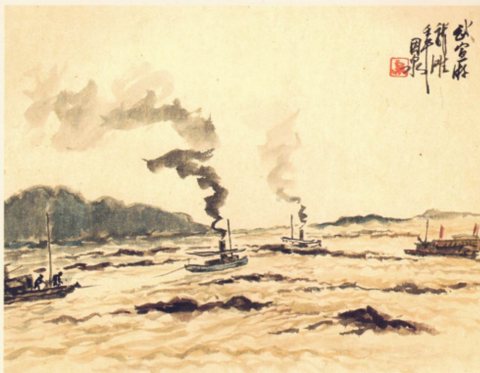
武宣游龍灘（《風景寫生冊》之四九） 1942年作 Youlong Shoal, Wuxuan County ( Landscape sketches, no. 49 ) Dated 1942