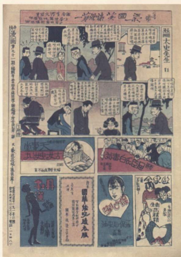
《半角漫畫》 第六卷 第十一期 1929年出版 Banjiao Manhua (Half-dime comic) Vol. 6, issue 11 Published 1929