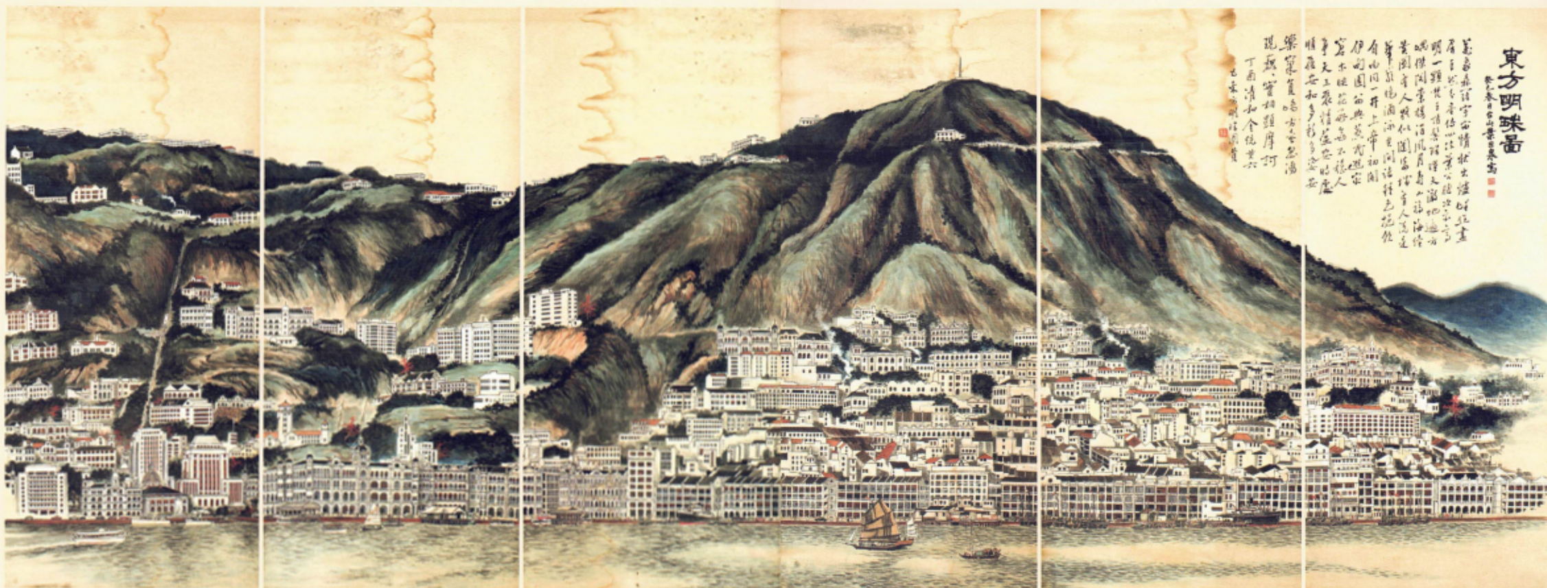
東方明珠圖 1953年作 Pearl of the East Dated 1953