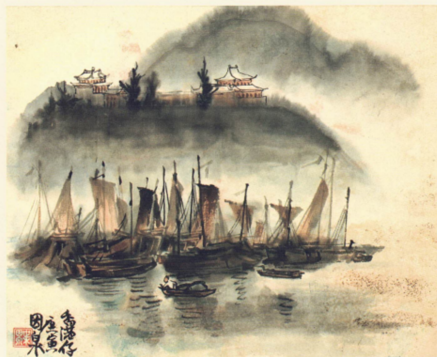
香港仔 (《風景寫生冊》之二四〇) 1950年作 Aberdeen (Landscape sketches, no. 240) Dated 1950