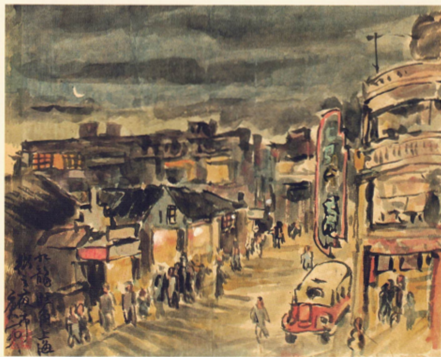
九龍旺角上海街夜市 (《風景寫生冊》之二三一) 1950年作 Night Market at Shanghai Street, Kowloon (Landscape sketches, no. 231) Dated 1950