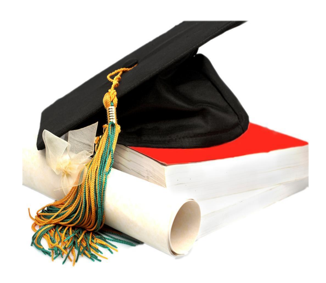
G.W. HEWLETT HIGH SCHOOL