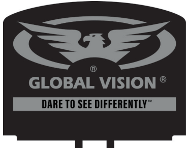
D-40 GV SIGN