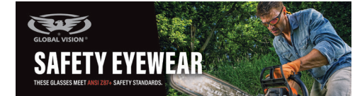
D-SIGN SAFETY 1