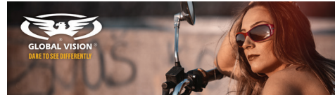
D-SIGN HARLEY 1