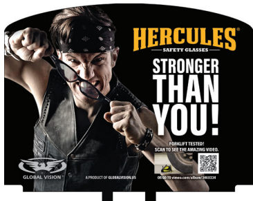
D-40 HERCULES SIGN