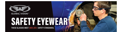
D-SIGN SAFETY 3