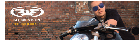
D-SIGN SPORT 2