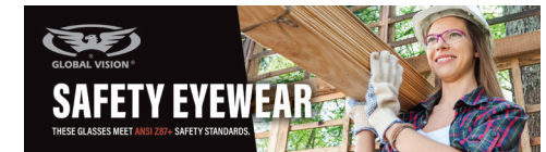
D-SIGN SAFETY 2