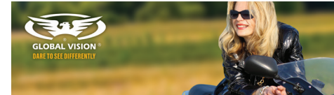
D-SIGN SPORT 1