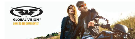
D-SIGN SPORT 3