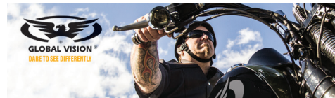
D-SIGN HARLEY 2