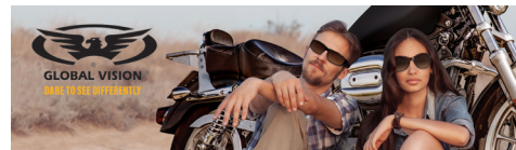
D-SIGN HARLEY 3