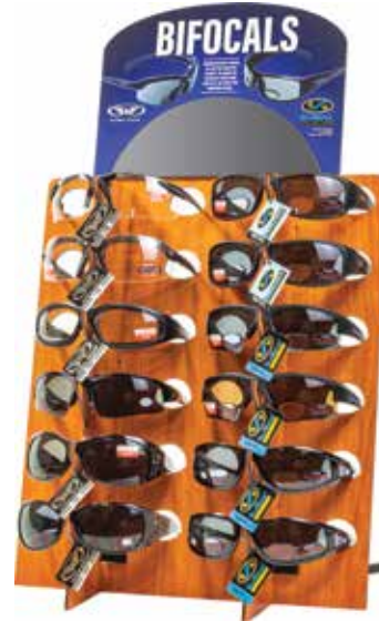
12-PC BIFOCAL COUNTER DISPLAY D-12PC DX BIFOCAL 12-PC DARK WOOD 23" H X 10" D X 14" W