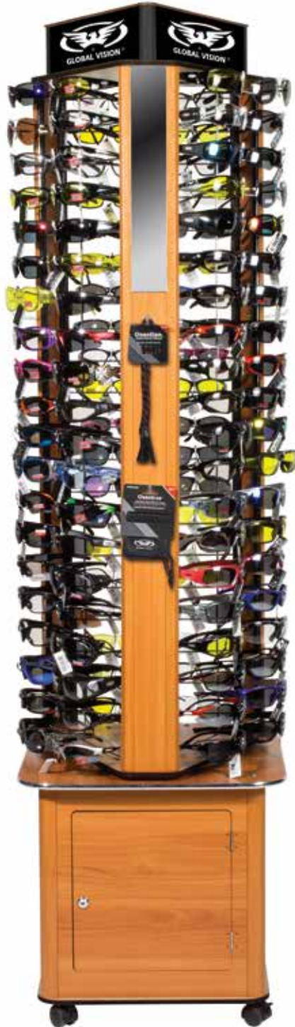
120-PC ROTATING PEDESTAL FLOOR DISPLAY D-120PC X DISPLAY AND PEDESTAL 75" H (SIGN INCLUDED) X 23" D X 23" W