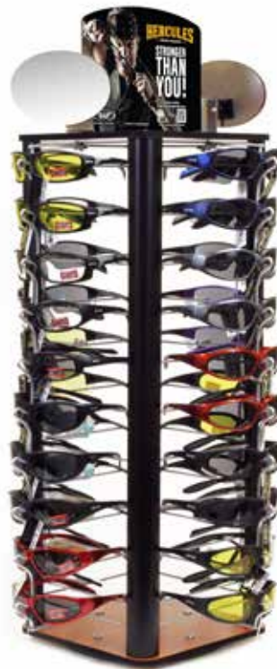
40-PC ROTATING DARK WOOD COUNTER DISPLAY D-40M WOOD 32" H (35.5" H WITH SIGN INCLUDED) X 18" D X 18" W

5760 N. Hawkeye Ct. SW • Grand Rapids, MI 49509 (800) 927-2801 • sales@globalvision.us globalvisioneyewear.com