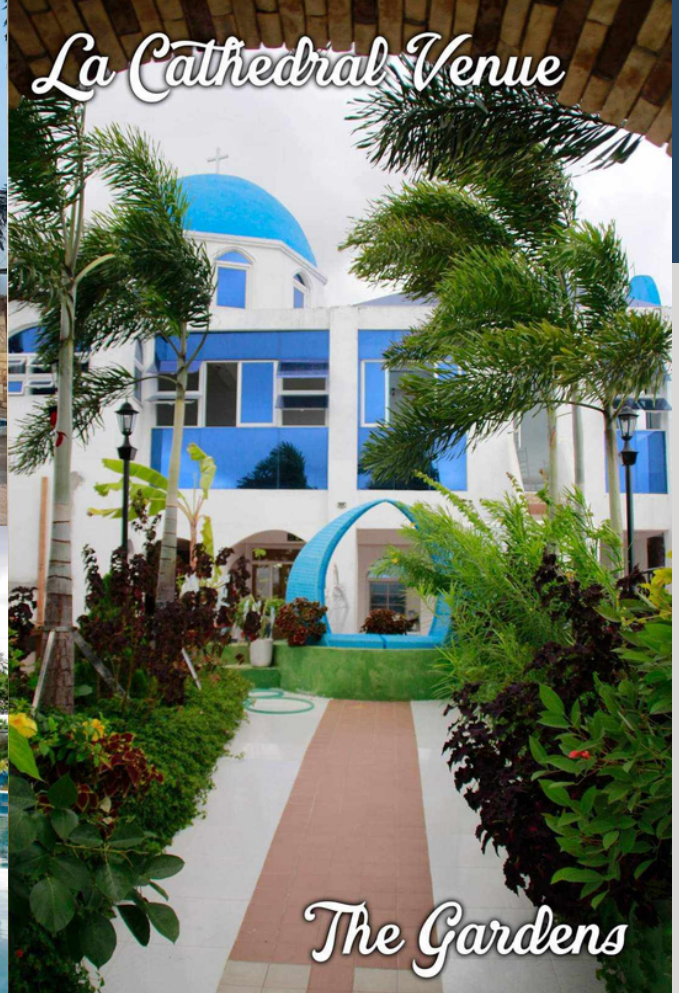
La Cathedral Venue