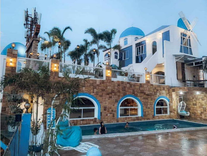
The Poolside Venue