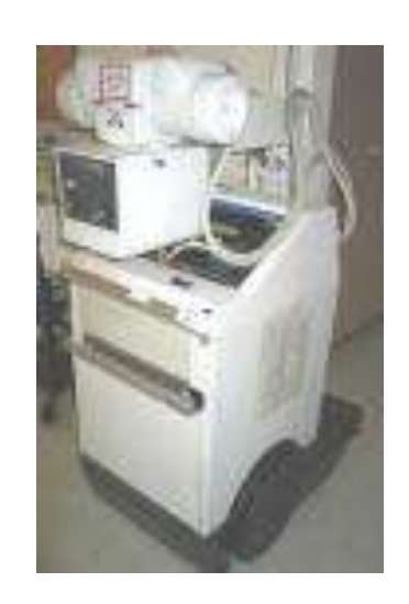
Portable x-ray machine