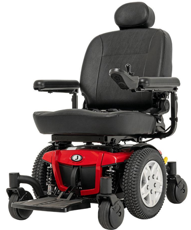
FDA Class II Medical Device