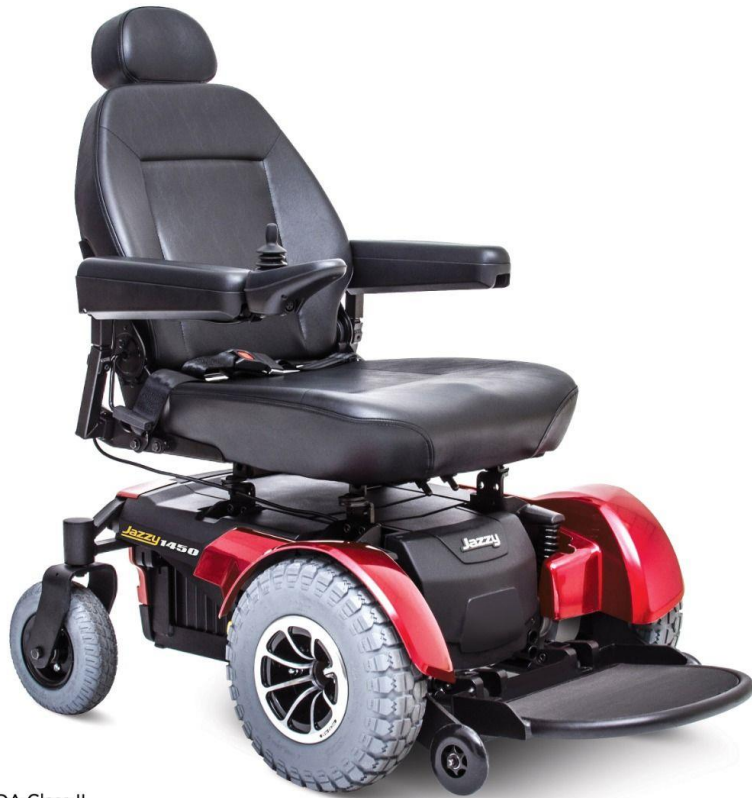
FDA Class II Medical Device*