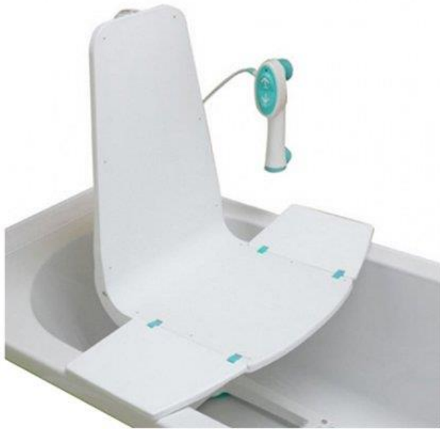
Power Bath Lift