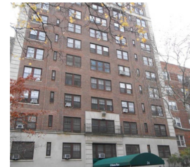
24 Street Tenants Corp