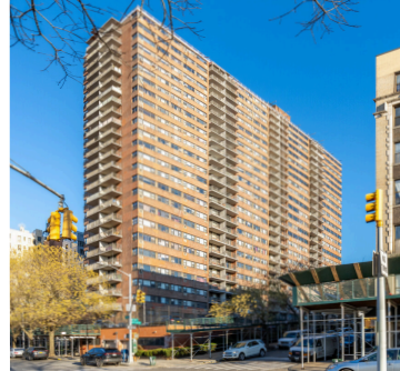
River View Tower

Over the years, we've achieved many remarkable successes, from revitalizing entire communities to upgrading major electrical systems. Our expertise is evident in every project we undertake. Our Kings Village Project is a shining example of our transformative capabilities, where we've successfully revitalized five buildings and 775 apartments over five years. Similarly, our progress at Riverview Towers showcases our dedication to efficiency, timely delivery, and modern living spaces. We've also enhanced the functionality and appearance of Ocean Breeze Renovation and The Centra Condo. Our innovative solutions have saved Fordham Hill Oval $4 million, indicating our commitment to cost savings and value engineering. Our upcoming project, the Good Tidings Gospel Chapel New York, which propels us further towards our goal of continued excellence in construction leadership.