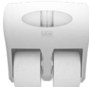
White | D67052