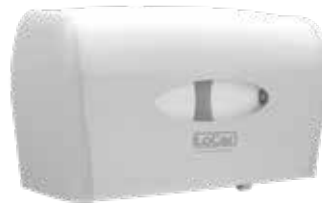
White | D67022