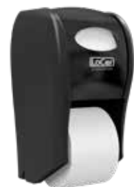
Black | D67013