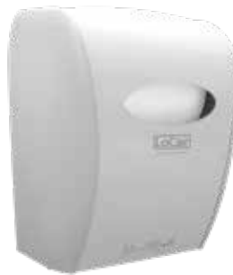
White | D68005