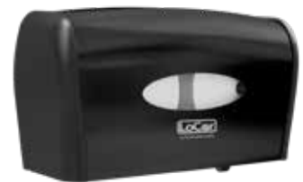
Black | D67023