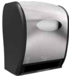
Stainless | D68001