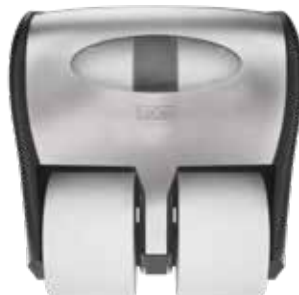
Stainless | D67051