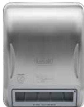
Stainless | D68011