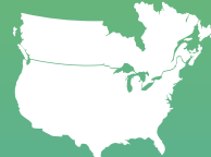
6. North America Distribution