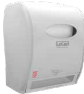
White | D68002