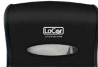
Black | D67033

LoCor® Jumbo Bath Tissue works with both Jumbo Bath Tissue dispensers, to provide 1200 feet of continuous paper, right down to the core.