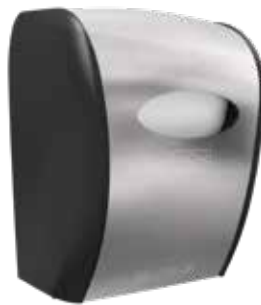
Stainless | D68004