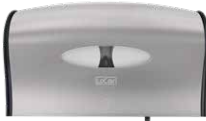
Stainless | D67041