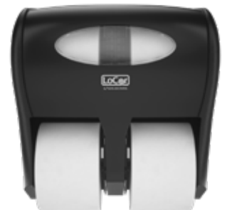
Black | D67053

For maximum efficiency, our high-capacity LoCor® bath tissue fits both side-by-side and top-down dispenser models, and is available in 1000-and 1500-sheet rolls.