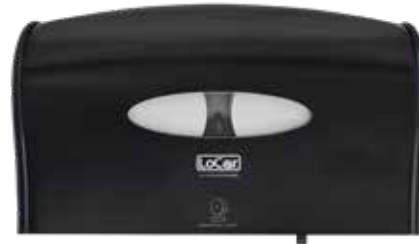
Black | D67043