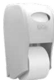
White | D67012