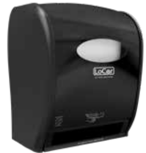
Black | D68003