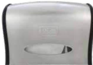
Stainless | D67031