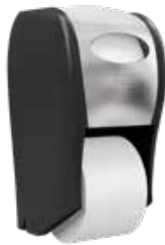
Stainless | D67011