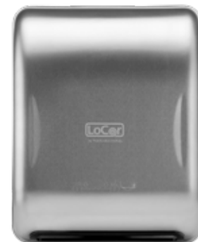
Stainless | D68012