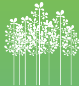
2. Responsibly Managed Plantations