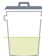
LoCor® Tissue vs Universal Bath Tissue (80 Roll / 500 Sheet Count)