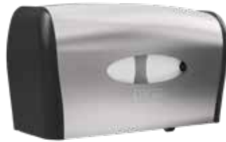
Stainless | D67021