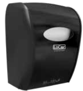
Black | D68006