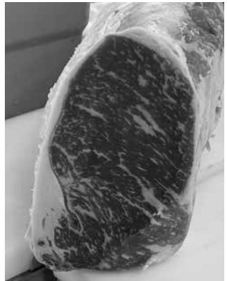
Right: 1/2 Akaushi 1/2 Charolais