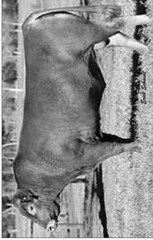
HEARTBRAND RHUBARB 2142A

Rhubarb has done it all for us. His sons and daughters have been sale tops in our previous sales. He is a son of Rueshaw 430 (semen $6000 per straw) and a daughter of Big Al.