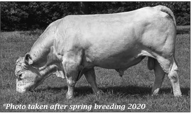
*Photo taken after spring breeding 2020