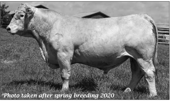
*Photo taken after spring breeding 2020