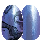
Northern Wonder FDS484 shimmer

#BeColorful™ #BeBrilliant™ #BeColorStreet™