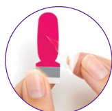
REMOVE CLEAR COVER