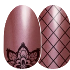
Style District FDS482 shimmer