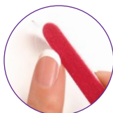
GENTLY FILE EXCESS OR REMOVE WITH FINGERNAIL