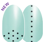
I've Dot a Feeling FDC230 creme