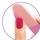
GENTLY FILE EXCESS OR REMOVE WITH FINGERNAIL