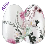
Flora Good Time FDS507 shimmer