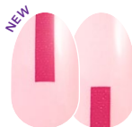
Pink Outside the Box FDC228 creme