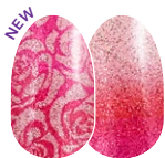
Rosé all Day FDG267