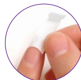
REMOVE CLEAR COVER & APPLY TIP TO FREE EDGE OF NAIL