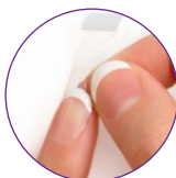
APPLY OVERLAY TO NAIL