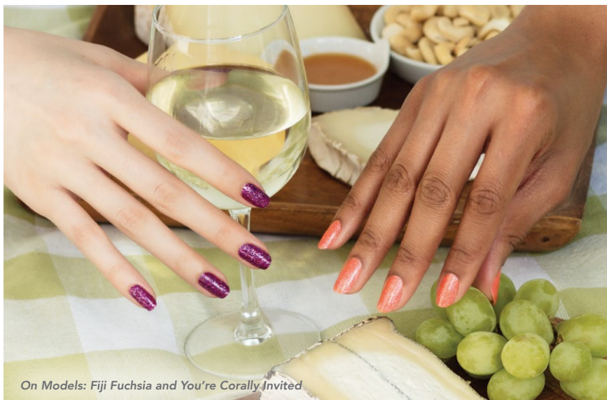
On Models: Fiji Fuchsia and You're Corally Invited