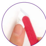
FILE EXCESS OR REMOVE WITH FINGERNAIL