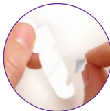
REMOVE CLEAR COVER & PEEL POLISH OVERLAY