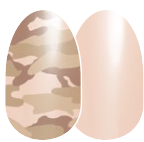
Boot Camp FDC205 creme