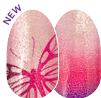
Wing Woman FDS508 shimmer