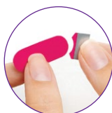
REMOVE TAB & SELECT END