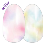
Don't Quit Your Daydream FDF256 frost