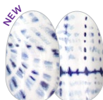
Blue My Mind FDF257 frost