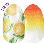
Squeeze the Day FDS509 shimmer