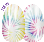
Peace, Love, and Tie-Dye FDS510 shimmer