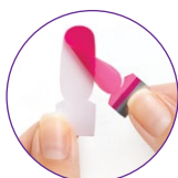
PEEL POLISH STRIP