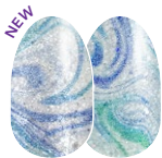
Water You Up To? FDG269