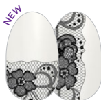
I Love Lacey FDL028 clear