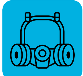
Disinfect facepieces and other personal protective equipment