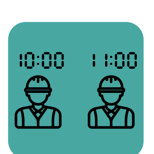
Stagger start and finish times