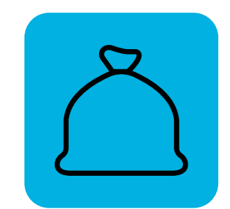
Bag work clothes when bringing home laundry