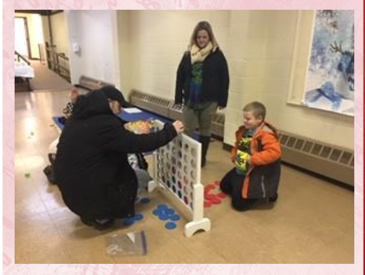
Families enjoyed the Oversized Games!