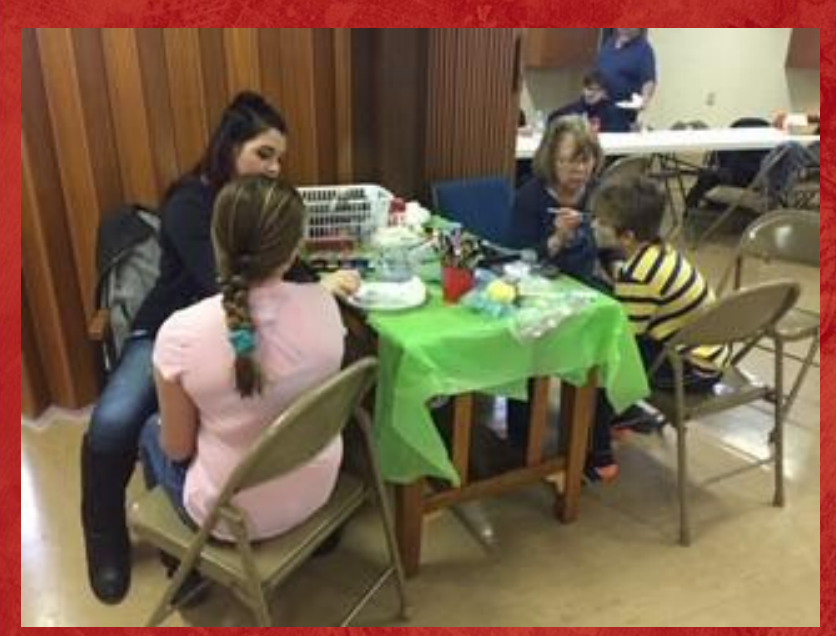
All the children enjoyed getting their faces painted!