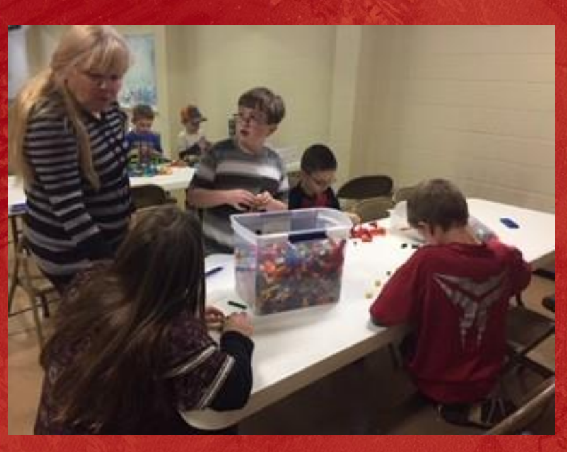
The children looked forward to coming to play LEGOS