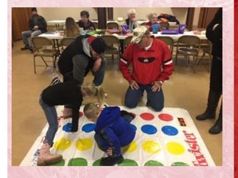
Children from the community enjoyed a safe place to come for a family event!