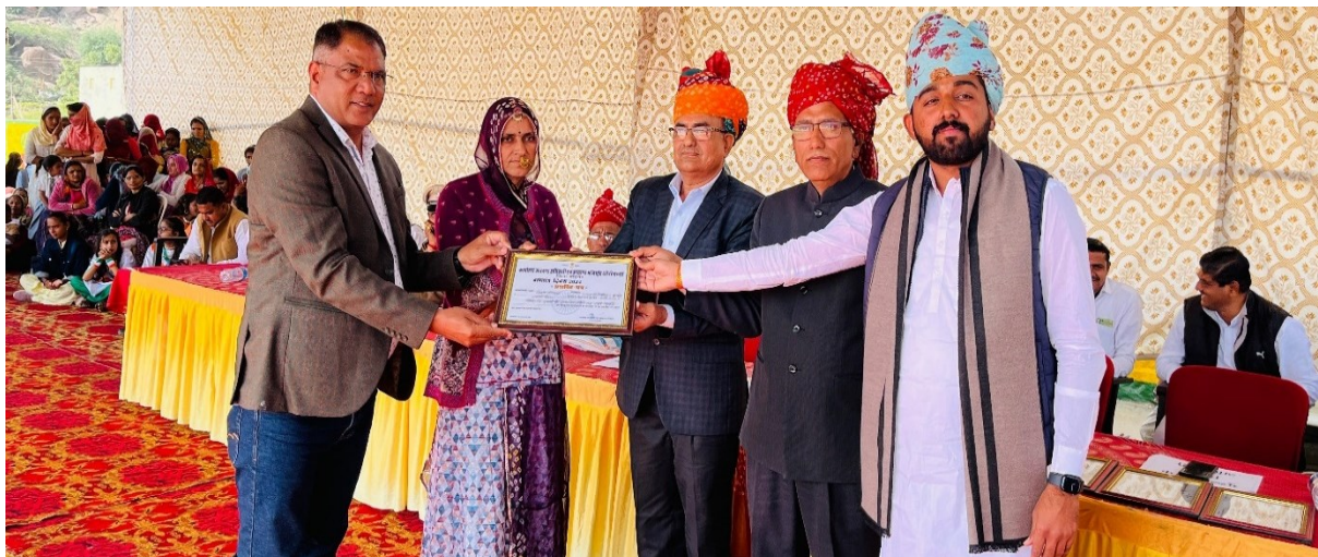
Block Level felicitation of the organization for Biparjoy Relief Work in Barmer Distt.