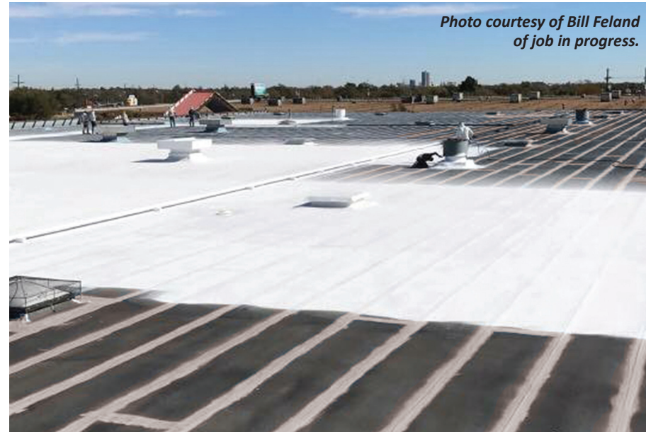
of job in progress.

“I like the versatility, strength, and waterproofing capabilities of the Membrane Coating System. The available 10-year warranty* gives both my customers and I peace of mind. The high-quality Spunflex® fabric used in this system is flexible and easy to work with. Due to coastal wind uplift and potential hurricanes, having a seamless commercial roofing system is a must here in south Florida!”