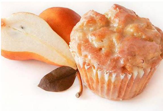
pear ginger muffin

Cupcakes $3.25 per cupcake (minimum of 6 to place an order, unless noted) ***minimum of 12***