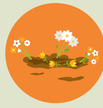
digging up your garden

That's what happens when your mind goes into fear, anxiety, anger, or rumination.