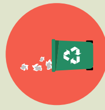
rummaging through garbage