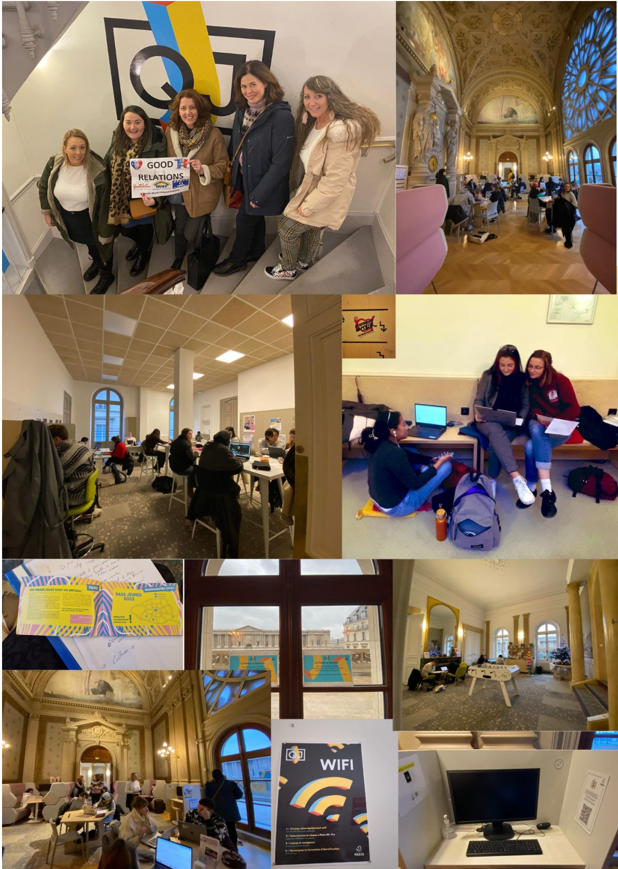
Visit to the Quartier Jeunes, Paris, France, December 2022