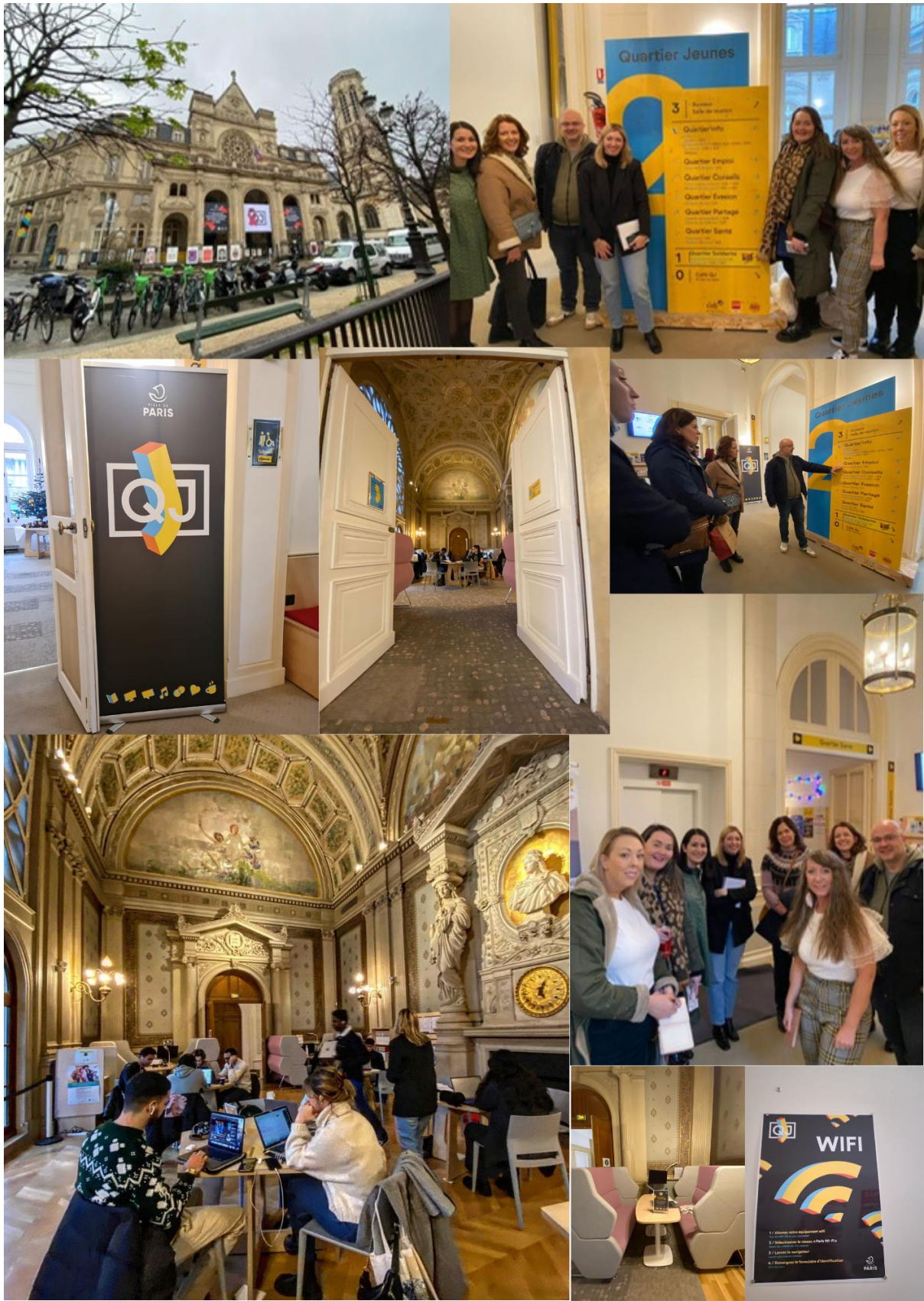
Visit to the Quartier Jeunes, Paris, France, December 2022