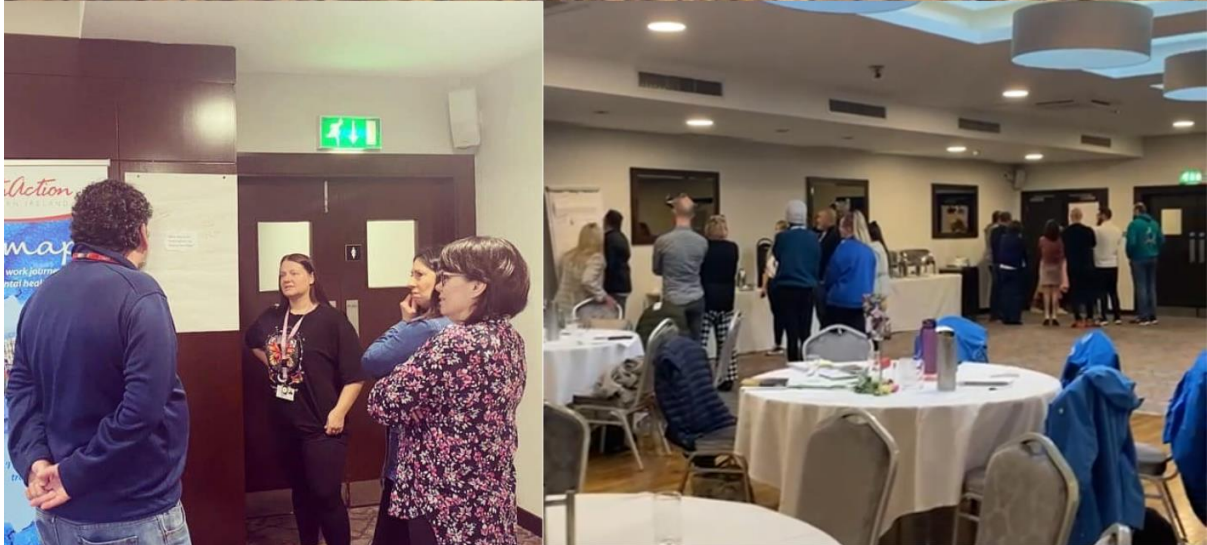
“YOUTH HQ in Derry-Londonderry: impossible or inevitable?” May 2023