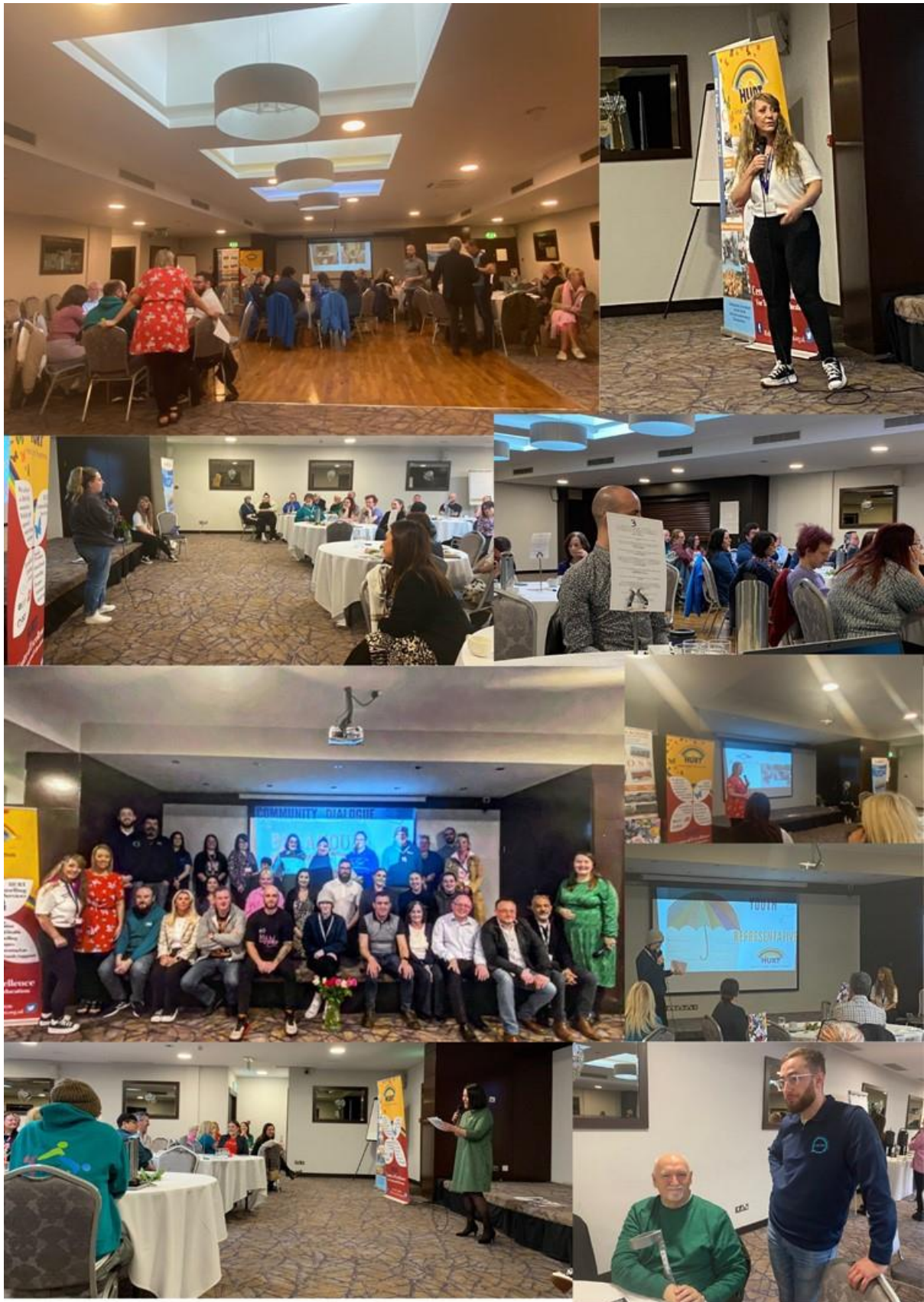
“YOUTH HQ in Derry-Londonderry: impossible or inevitable?” May 2023