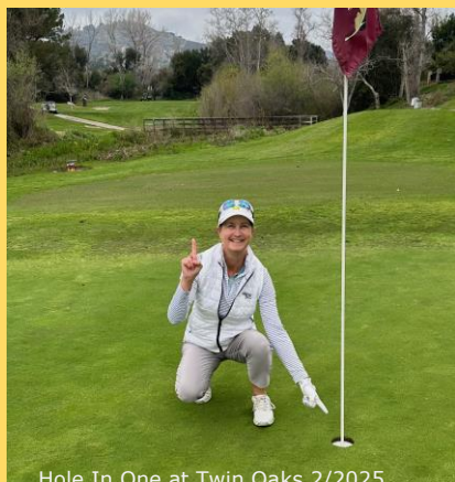
Hole In One at Twin Oaks 2/2025

I grew up in Orange County, CA., and attended San Diego State where I got my degree in graphic design and started my career. I'm married with 2 boys in college and now work part-time as an elementary school substitute teacher...when it doesn't interfere with my golfing addiction. I first learned to golf with my brother and the 'guys' after college in my mid-twenties. Armed with adult beverages and borrowed men's clubs, I hacked my way around SD and OC golf courses for various years, no lessons required!