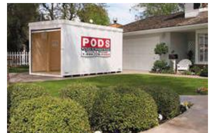
PODS container placed on a driveway

PODS is an enclosed, portable storage container that is delivered to a person’s home for the purpose of moving or storage. Once the PODS is filled with its contents, it is either delivered to its destination or sent to a storage facility. After fourteen (14) days, a PODS container is considered to be a portable shed and, therefore, is subject to St. Louis County ordinances that regulate sheds, including the permitting process for sheds. For County ordinances regarding sheds, please see Sheds/Exterior Storage.