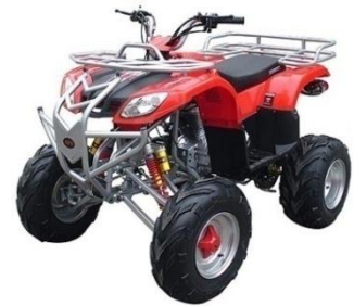
All Terrain Vehicle (ATV)

Contact: St. Louis County Police Department Non-emergency reporting/ General information (314) 889-2341 TDD (314) 889-2345