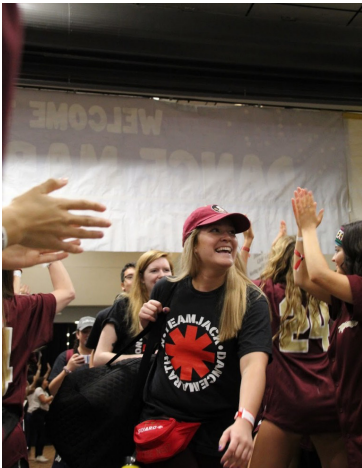
students walking into DM

Dance Marathon is a huge event at FSU and raised over $2.2 million for the Children's Miracle Network. It is a great opportunity to increase our presence and involvement on campus. Learn more about Dance Marathon at www.dmsu.org .