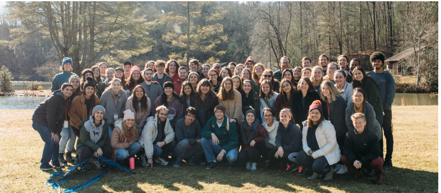
Group photo at Winter Retreat 2019