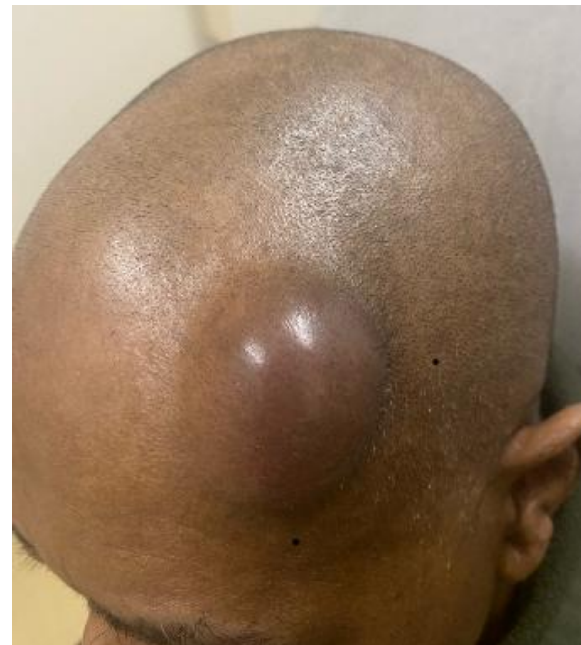
Image 2: Left forehead swelling measuring 4x3 cm