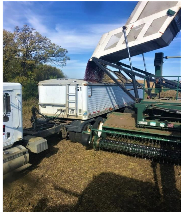
Last load of kidney beans being loading into the truck

rest will be average. This year, we had all of our fields perform around the average—we didn’t have a stellar one to brag about, and we didn’t have a trainwreck to complain about. Just a good, consistent crop and the quality was still quite good despite some very dry conditions. All of our beans were raised on irrigated sand this year, so we controlled the precipitation and were able to harvest without any mud interfering with the quality sample. Once again, our customers were Chippewa Valley Bean in Menomonie, Wisconsin and Bonanza Bean in Morris, Minnesota.