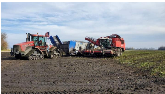
Wrapping up the last field of sugarbeets.