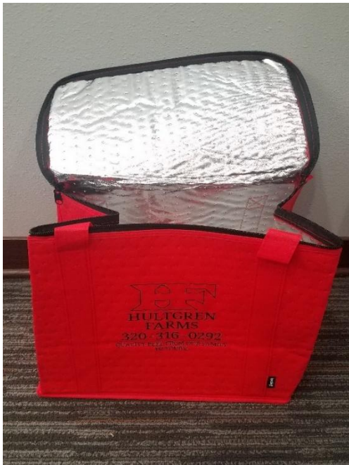
New customized cooler bags ensure order quality during delivery.

If you are looking to take advantage of this new opportunity, give us a call at (320) 316-0292 ext. 2 and we would be happy to add you to our upcoming delivery date in March