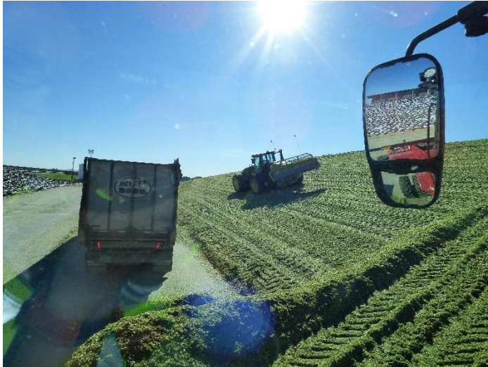
Corn silage pile being built at Meadowstar Dairy

We had a fantastic harvest crew for sugarbeets this year as well and a big thanks goes out to all of our drivers!