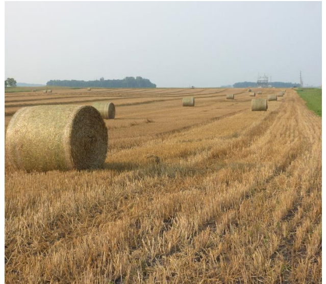
Rye straw baled after grain harvest in the field.