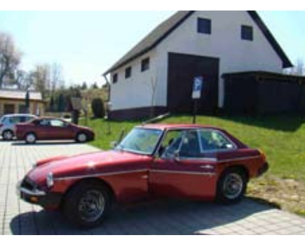
A break from the autobahns in Germany

'This car is fantastic for longdistance touring, but push it and you can feel how rapidly technology has progressed'