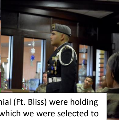
Soldiers at the Centennial (Ft. Bliss) were holding a Prayer Luncheon, of which we were selected to present the colors at the beginning.