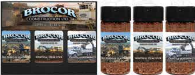
K3S 3 PACK SPICE 4 oz