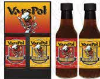
K2H 2 PACK HOT SAUCE