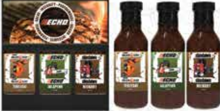
K3B 3 PACK BBQ SAUCE 3 - 12 oz BBQ Sauce