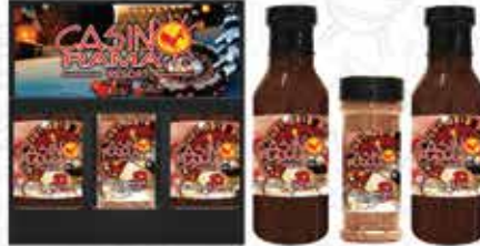
K3SBB 3 PACK BBQ SAUCE & SPICE 8 oz 2 - 12 oz Sauce & 1 Spice 8 oz