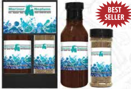
K2SB 2 PACK - 1 BBQ SAUCE - 1 SPICE 8 oz