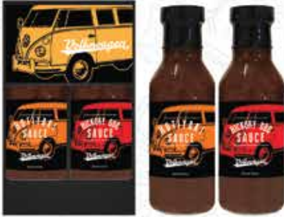
K2B 2 PACK BBQ SAUCE