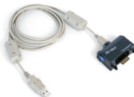
S9 USB adapter 36950