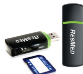
SD card reader 36931 • USB extension cable 7071015