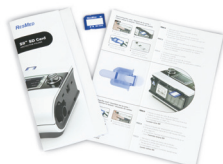
SD card protective folder • 36840 (10 pack, including SD Card) • 36845 (10 pack, folder only)