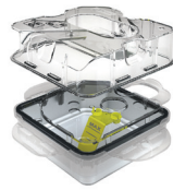
H5i cleanable water tub (MPMU) 36800