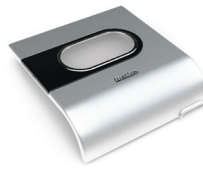
H5i flip lid 36891