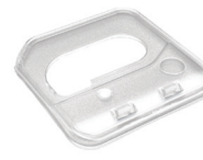
H5i flip lid seal 36892