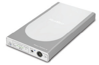
ResMed Power Station II (RPS II) 24923