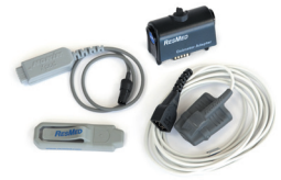
S9 complete oximetry kit 2 369100

2 Not compatible with S9 Escape or S9 Escape Auto.