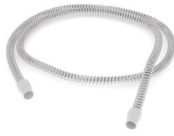
Standard tubing • 6'6" replacement standard tubing 14987