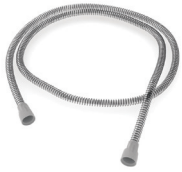
SlimLine™ tubing 36810