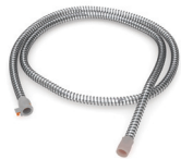
ClimateLine tubing • 6'6" ClimateLine tubing 36995 • 6'6" ClimateLine MAX tubing 36997