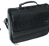
S9 travel bag 36860