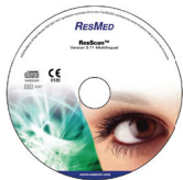
ResScan™ patient management software Contact ResMed for product ordering information.