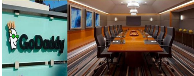
Mr. BOBI Dual Business Relations (DBR) Interlochen with CCCT Seats at the Table One Stop Shop Workforce.

BOBINOMICS ECON ONE STOP SHOP ONE STOP SHOP SEATS AT THE TABLE CAMPAIGNS 2025-2029