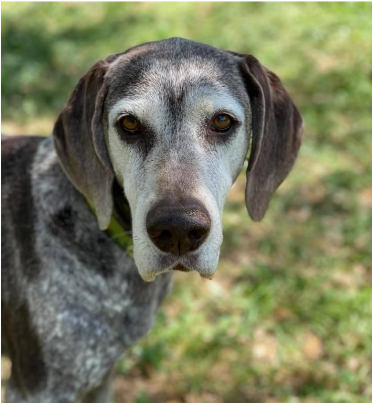
CH Southwind's Rock Slide From NEWPoint CD GN RAE MH DJ CGC AN (10/15/2008 – 9/6/2021) Pat & James Dunn