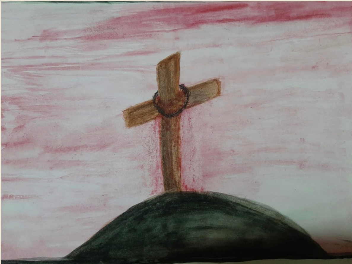
But God demonstrates his own love for us in this: While we were still sinners, Christ died for us. Romans 5:8