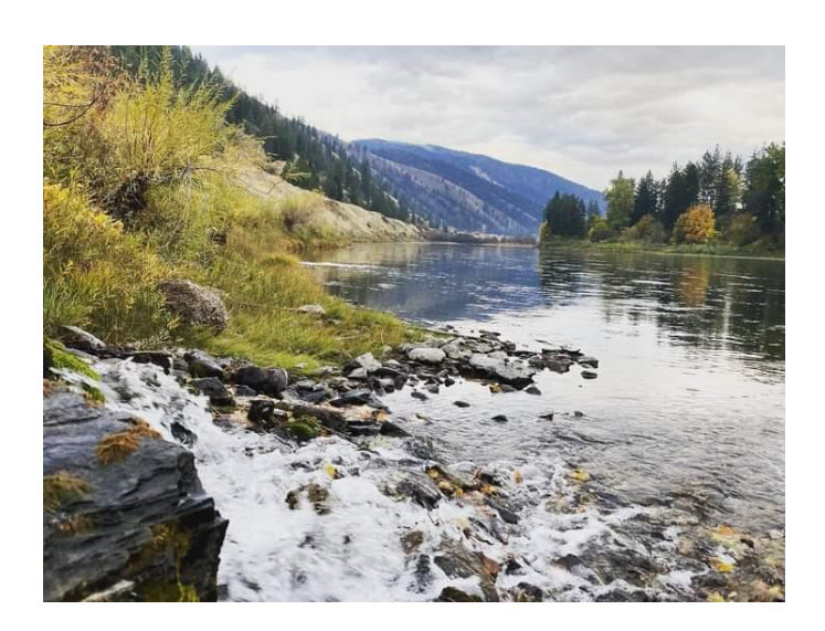
The Connection of Prayer

Is a 501 C 3 Non-Profit Organization All donations are Tax Deductible