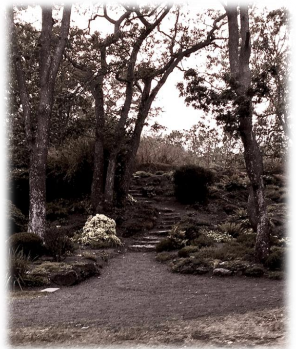
Beacon Hill Park was declared as protected lands in 1858

For whatever reason, female spirits seem to be manifest at this location and all seem to have a similar eerie demeanour, quietly staring. What is it these staring