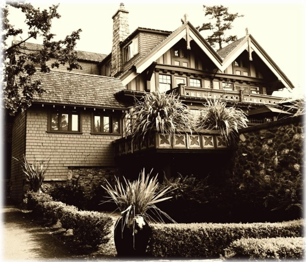
Formerly known as Rosemeade