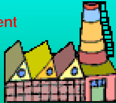
Businesses / Firms

<<<goods & services<<< >>$ government spending $>> >>>public goods>>> <<$ taxes $<<