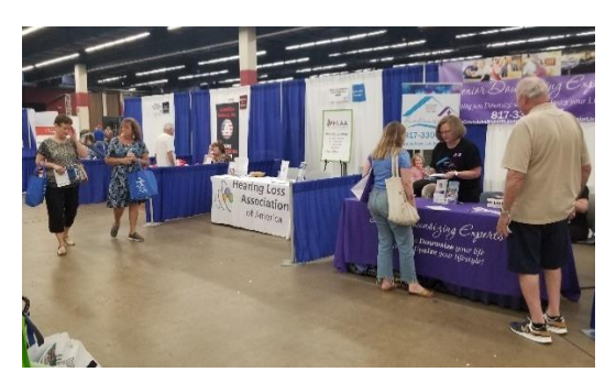
Row 5 booths at Empowering Seniors event