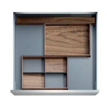
THE FRANKFURT THE SYDNEY