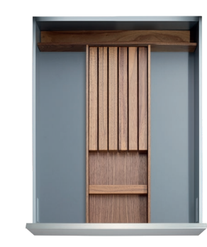
THE SAN FRANCISCO