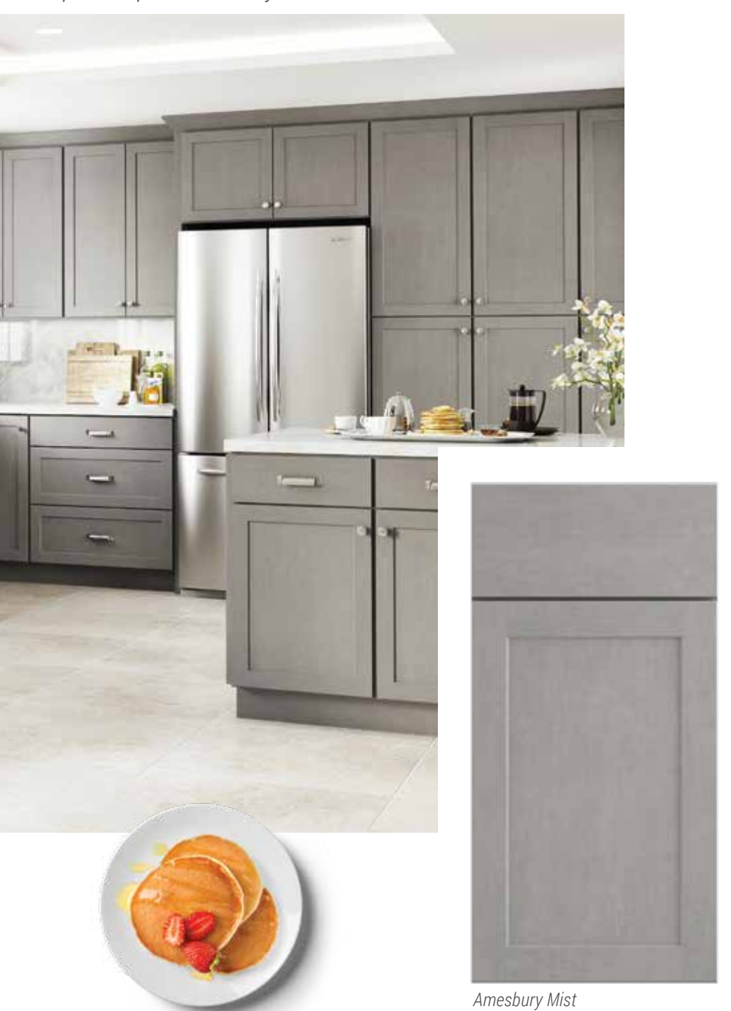
Exquisite spaces with style.