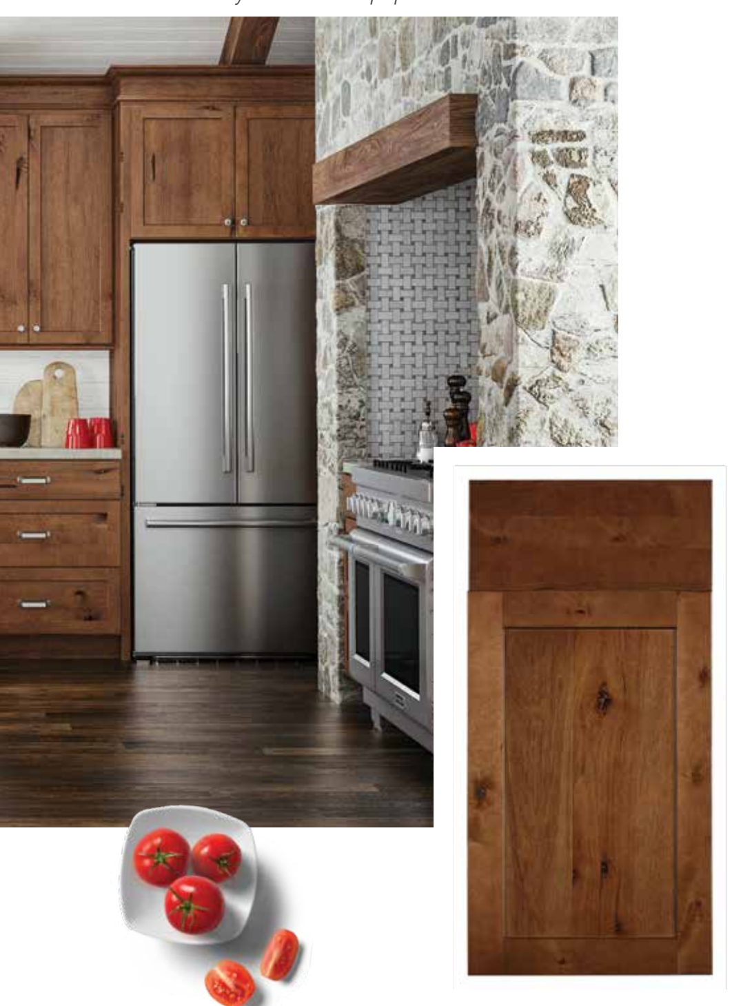
Rustic finishes make your cabinets pop.