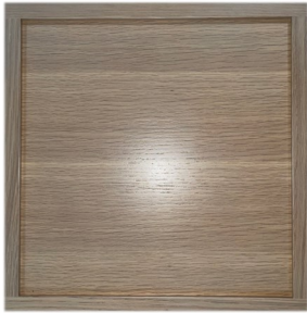
WHITE SALT OAK