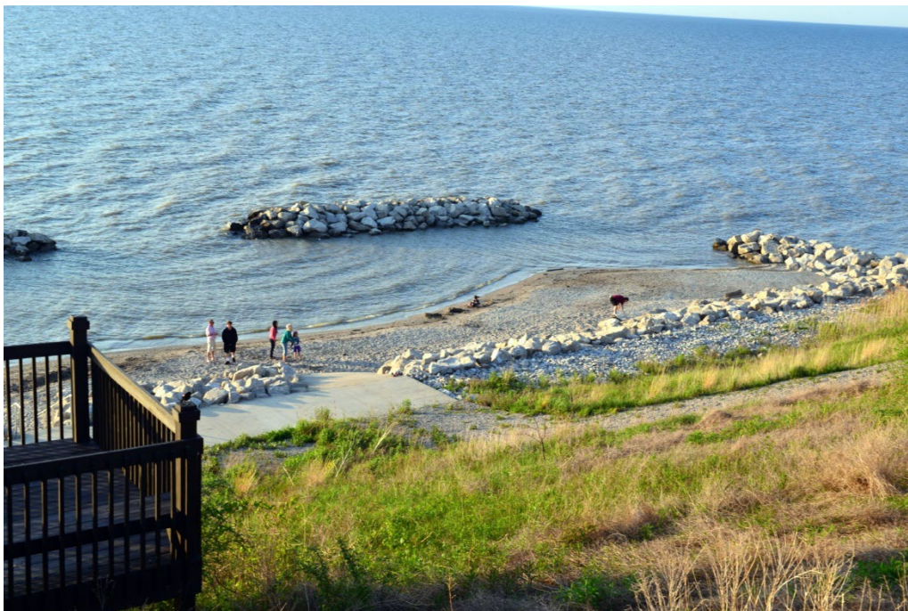
MPCA beach goes