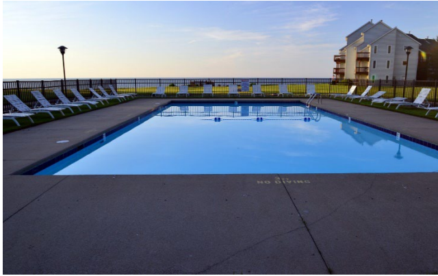
Beautiful MPCA Pool