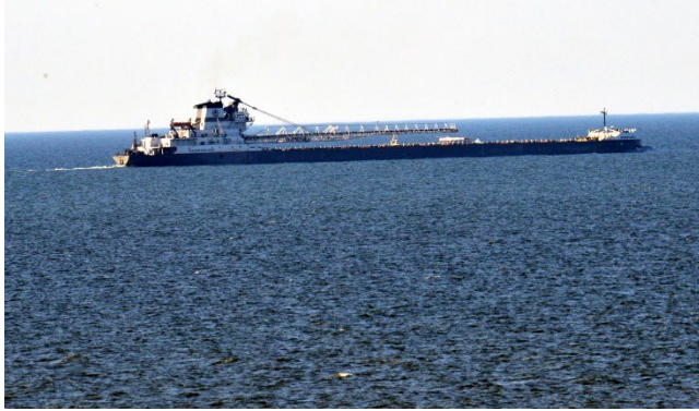
Lake Erie Barge