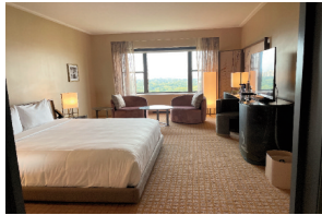
Park View 430/sf