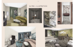
1 Bedroom Suites 760-820/Sf

No Bed Removal | Check-In Time starts at 3:00pm