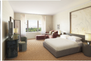
Studio Suite 500/sf